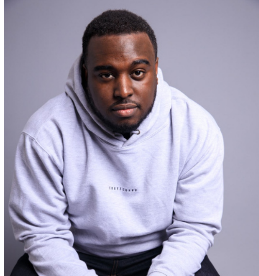
② TG Original Hoody