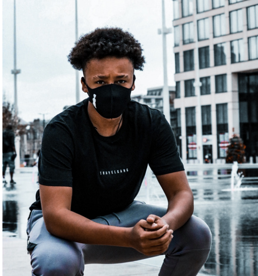
① TG Classic T-Shirt