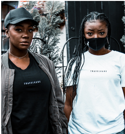
③ Ladies Lounge Dress